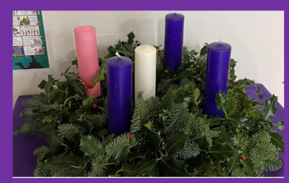
Advent is a time of <u>preparation and waiting</u>. Sunday 11<sup>th</sup> December was Gaudate Sunday.

http://www.wednesdayword.org/school/index.htm